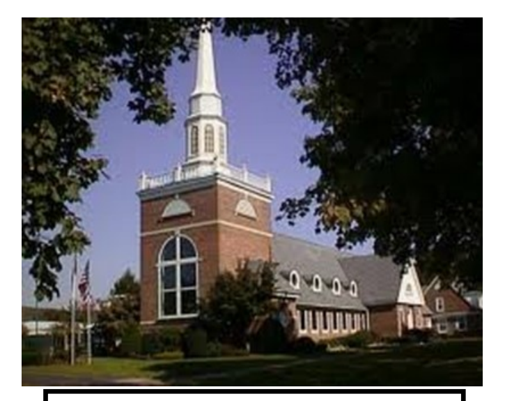
SEPTEMBER 2022 JOURNEY